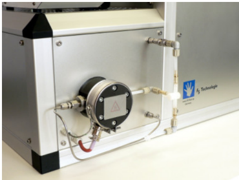
Pump for high and low-viscous oils. Heated pump head, pulsation free flow, no slip.