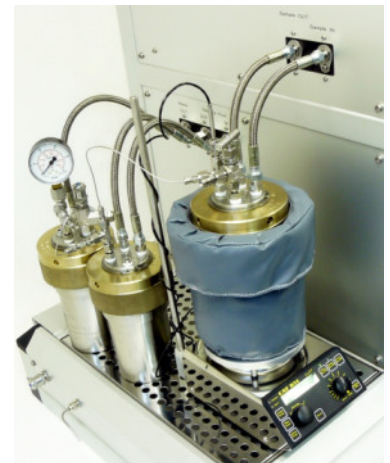
High pressure sample cells