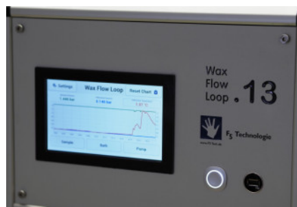
Bright colour touch-screen display